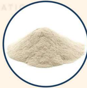
Guar Gum Powder